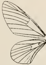
NEURATION OF Calapterote butleri ♂.

♂. Palpi minute, erect, appressed to front; antennae short, rather heavily bipectinate, the setae depressed; legs short and moderately hairy. Forewing broad, the outer margin evenly rounded, the inner margin straight; the discocellulars evenly curved; vein 6 from near the upper angle of the cell; veins 7, 8, and 9 issuing from the extremity of a long stalk, rising from the upper angle of the cell, which also carries veins 10 and 11 at its anterior extremity just beyond the cell;